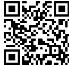
QR Code for Registration